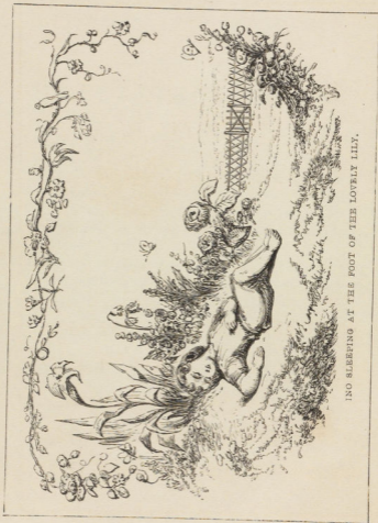
INO SLEEPING AT THE FOOT OF THE LOVELY LILY.